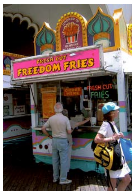
After 9/11, France refused to join "the coalition of the willing" to invade Iraq. So for patriotic Americans French Fries were out and Freedom Fries were in!

If we are well prepared to answer these types of questions whenever they come up, we can then be more effective in educating skeptics about the real truth. The most ardent skeptics often make the best Truthers once converted. And once converted, a person rarely, if ever, turns back to believing the big lie that is called the 'official story.'