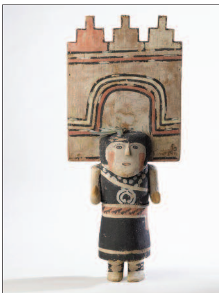
Pahlikmana, Hopi kachina doll, c. late 19th century, held in the Brooklyn Museum.

Kachinas can manifest visibly or they can remain invisible, but White