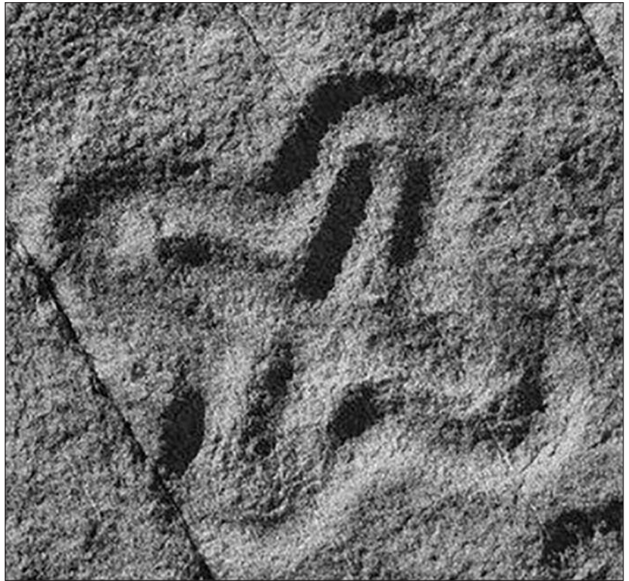
Etched equilateral cross petroglyph seen at Inscription Canyon near Prescott, Arizona.

In ancient times it was known among certain people that intelligent beings had come from space and helped cultivate mankind out of its primitive state, but this knowledge was nearly lost when the Earth suffered global and semi-global cataclysms. Some of this knowledge survived in the mythologies of aboriginal people, and even in the West some of this information