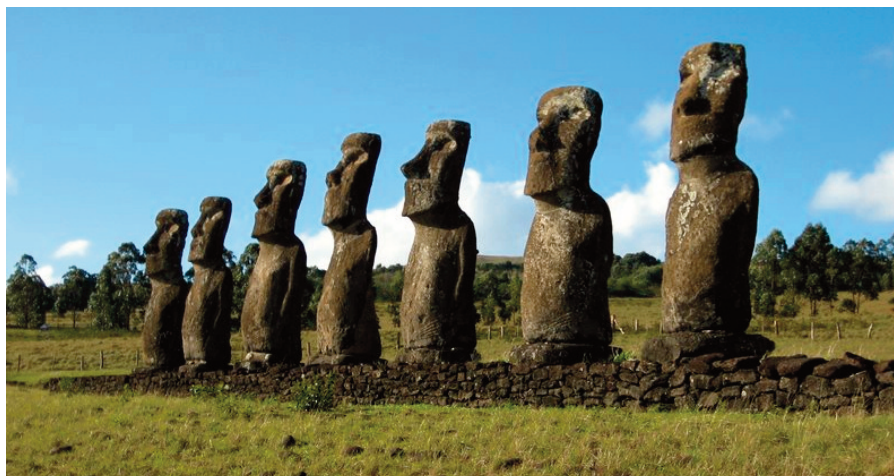
Seven moai stand as silent sentinels on Easter Island (Rapa Nui).

According to White Bear, not all the inhabitants of Atlantis perished when their continent was destroyed. Those who had not taken part in