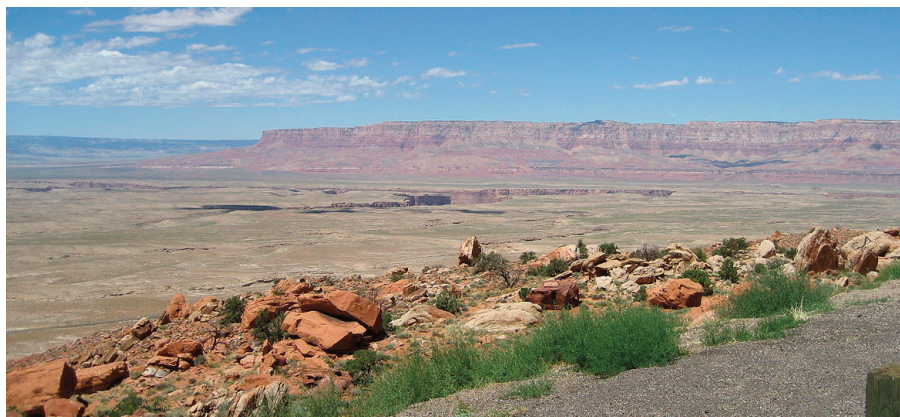
Panoramic view of the Hopi Reservation from Arizona State Route 264, located a few kilometres from Oraibi.

Shawn Hamilton can be contacted at kasskaran@protonmail.ch . For more information, visit his website http://theswillbucket.com/ .