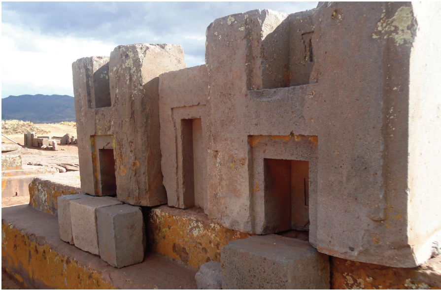
Massive, intricately worked, H-shaped stone blocks at Puma Punku are part of the complex at the Tiwanaku site, Bolivia.

they're related to the previously mentioned seven chakras. "Three are behind us, and three are in front of us. This fact is expressed in our impenetrable rituals as well as in some remains which have been found in Mexico and in South America," he said. "Timewise, we have already exceeded half of the seven worlds' lifetime because the duration of each world to come is shorter."