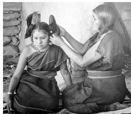
A Hopi woman dresses the hair of an unmarried girl, c. 1900.