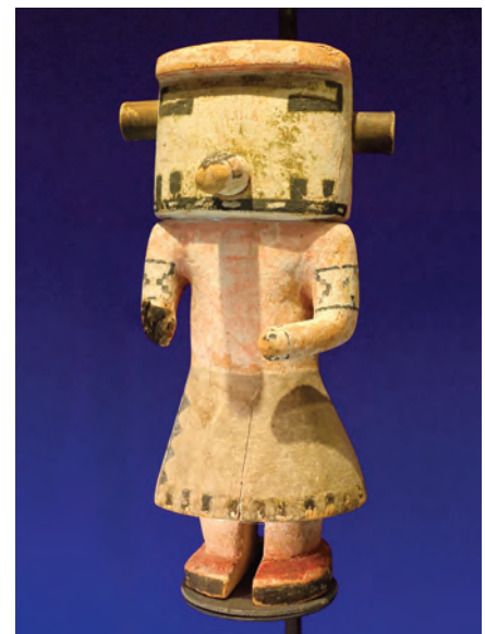
Kachina doll

When the Hopi ancestor clans were still migrating through South America into Central America, long before the Clan of the Bear settled