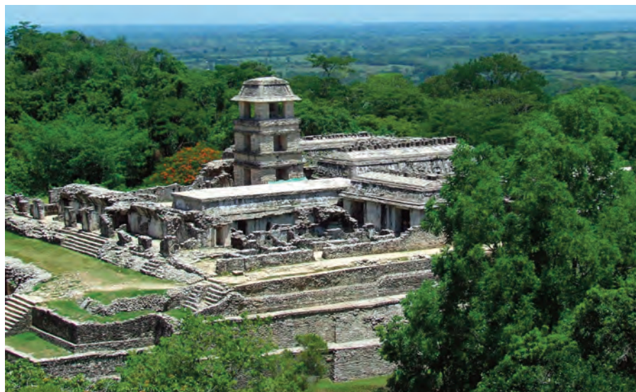
The palace complex at Palenque, Chiapas, Mexico

"The sound waves that we produce affect not only those who listen to us but the entire universe, and for this reason speech must be harmonious. In that way, we praise the Creator. This is why the Hopi in their ceremonies use song to praise