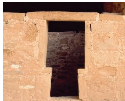
An example of a typical Hopi "keyhole" doorway, representing the nine worlds that humans must traverse to become united with the Creator.

"We wrote our symbols on rock because it is not easy to destroy them over time. We decorated our ceramics with symbols, and we still