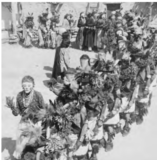
Kachina dancers of the Hopi pueblo of Shongopovi, Arizona, photographed some time between 1870 and 1900.

"Today we carry these symbolic figures with us—or, rather, in us. Not in a material form, but in a more subtle way. For example, during a ceremony when the Kachinas dance on the village square, they form their groups at