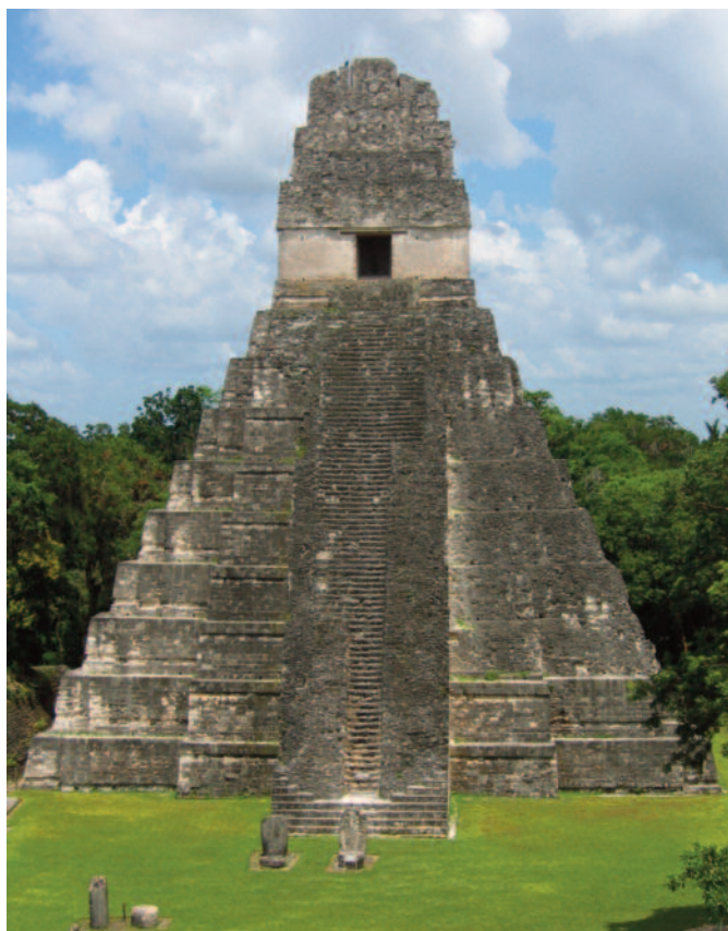
Temple 1, Tikal, Guatemala