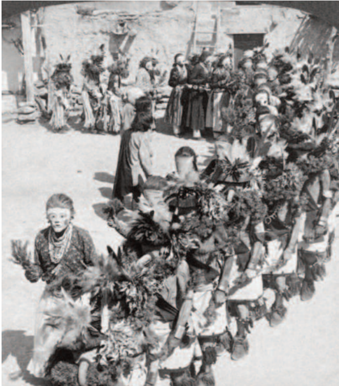
Hopi Kachina dancers, Shongopovi pueblo, Arizona, sometime before 1900

Eventually this city became an important centre. Its end arrived when it was attacked by the Clan of the Spider. The clans that lived there defended it courageously, but when the enemy diverted the river that fed the city, they had to give up. They did not capitulate, however, because they had dug a tunnel by which they were all saved. This city was the last great gathering place before the final reunification at Orayvi (Oraibi).