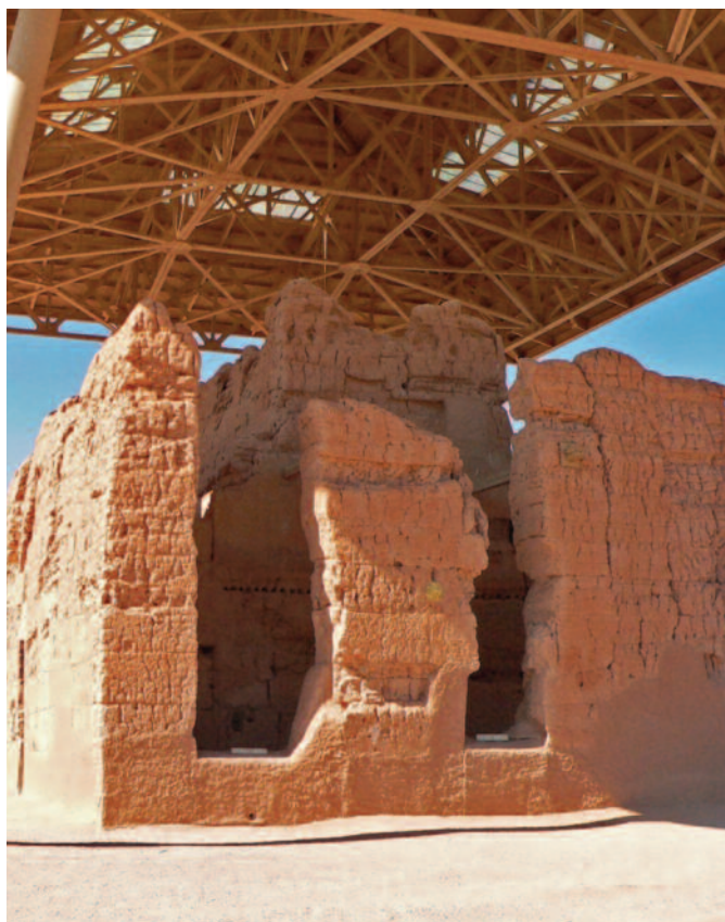
Casa Grande Ruins

break its adversary's shield. After a few hours in the afternoon the Snake Clan decided to try something else to demonstrate its power. Shooting ceased, and they used the capacities of the snake to bury themselves, building a tunnel below the fortifications of the Bow Clan.