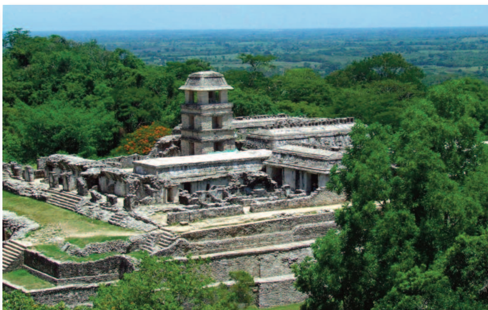
Palenque Temple Complex

"Aápa did these things in the presence of my parents,