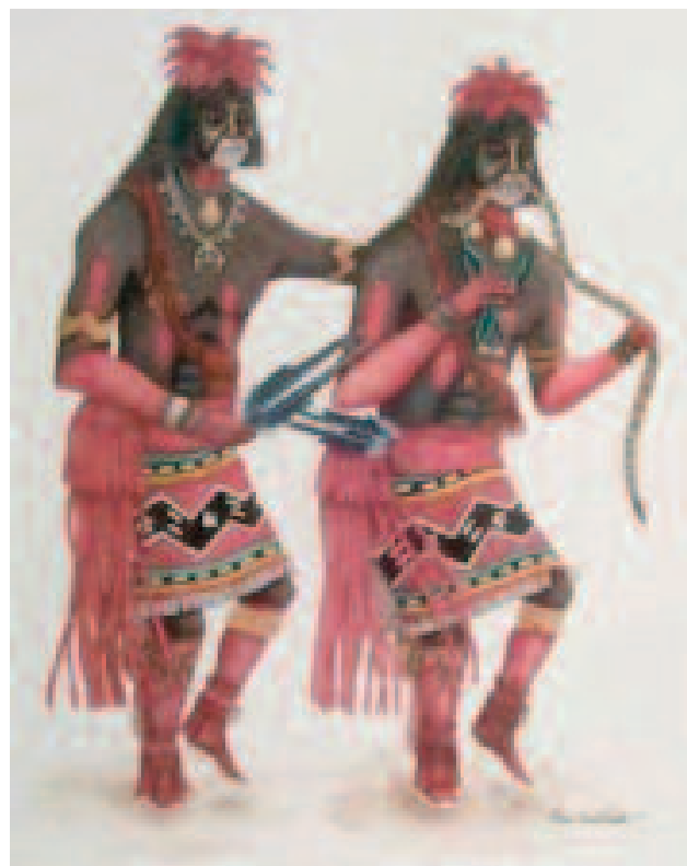
Hopi Snake clan

"The Clan of the Bow knew that it had not damaged the rival city and that the Clan of the Snake would retaliate the following day. Now it was the Bow Clan's turn to prepare for protection. The Sun rose and the Clan